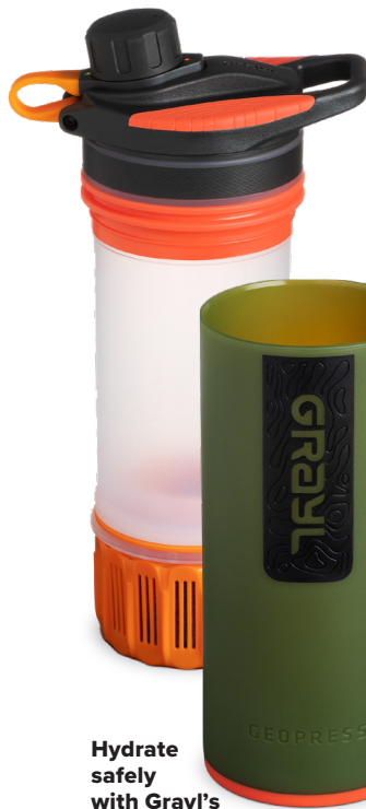
Hydrate safely with Grayl's water purifier.

Without a Trace No matter where the trail takes you, stay hydrated with Grayl's GEOPRESS™ Purifier . In eight seconds, it produces 24 oz of safe, clean drinking water from practically any water source. Zero pumping required! $89.95; grayl.com