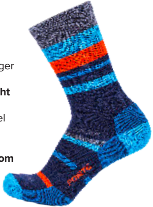
Quality footwear is an adventure-seeker's best friend.

Trail Magic Keep your feet drier longer with the Point6 37.5 Hiking Mixed Stripe Light Crew , a technical hiking sock with reinforced heel durability and strategic cushioning for foot hot spots. $23.95; point6.com